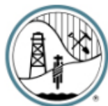
Rocky Mountain Mineral Law Foundation

Special Needs: If you have special needs addressed by the ADA, please notify us at least two weeks before the program.