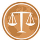
Institute for Energy Law