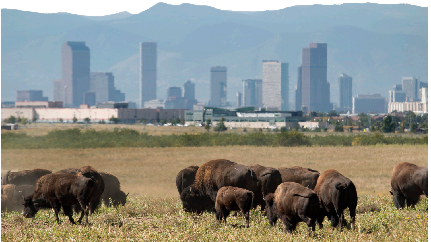
The Rocky Mountain Arsenal – now a National Wildlife Refuge – was the Superfund site that led the courts to address the question whether CERCLA preempts states' rights to enforce RCRA.

Whether you are a new lawyer, landman, or other professional working in oil and gas, mining, or public land law, a basic familiarity with hazardous substances law will benefit your practice. This one-hour video-linked CLE program will allow new professionals to learn the basics of the laws and regulations governing hazardous substances and wastes, and provide an opportunity to meet and network with your peers, without extensive time and travel.