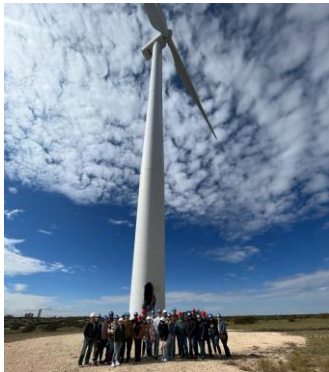
Students of Texas Tech University School of Law making site visits to a new oil-well site, oil-and-gas production operations, a wind farm, and a solar farm during the Fall semester.