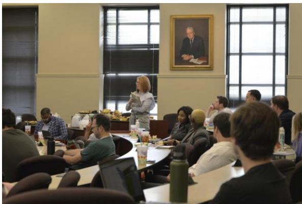
Students and representatives from government, NGOs, and industry attended a symposium on Methane Mitigation hosted by the LSU Energy Law Center.