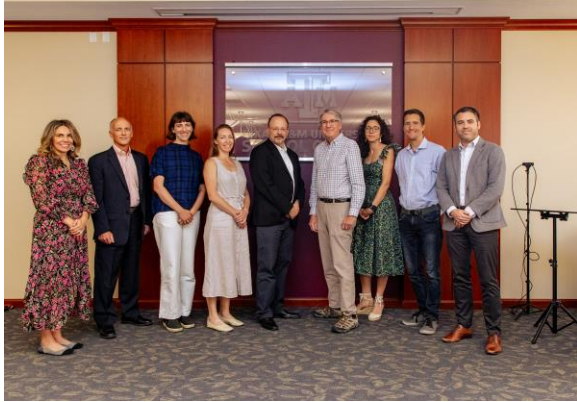
Texas A&M School of Law hosting its 6th Annual EnviroSchmooze Workshop in August 2023